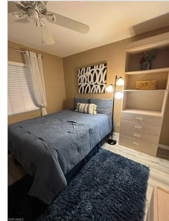
Bedroom - 2nd BEDROOM