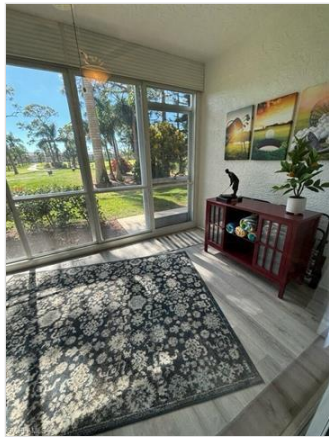
Sun Room - YOUR BACKYARD IS DIRECTLY ON THE GOLF COURSE w/ VIEWS OF A COMMUNITY POOL & LAKES ON THE GOLF COURSE. FORE!

One Time Fees Mandatory Club Fee: $2,600 Land Lease: $0 Rec. Lease Fee: $0 Other Fee: $890 Spec Assessment: $0 Transfer Fee: $100 Application Fee: $0 Total One Time Fees: $3,590