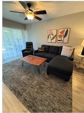
Great Room - THE SHEERS COVER GLASS WALL DOORS TO YOUR SUNROOM! GORGEOUS!